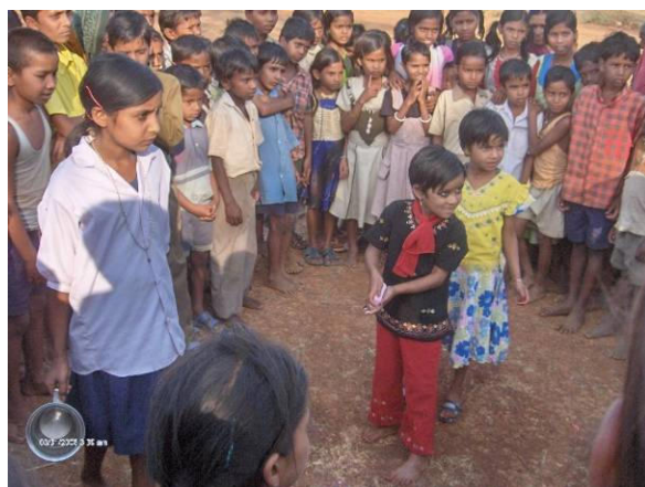
Fig: drawing competition for children

This has also increased the interest of children who are now more conscious about healthy habits of nail trimming, regular bath and washing hands. Local children have been involved in educating their peers about the benefits of hand wash which has shown very good response. Village level street plays, peer based events and the 9 card sets have been effective IEC materials to educate the community about hygiene and sanitation.